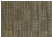
231 Industrial Patina