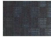
537 Cherished Ruins