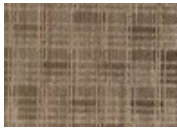
224 Contemporary History