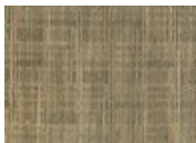
201 Alluring Origins