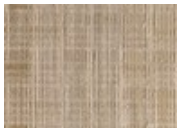
114 Organic Moire