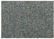
337 Slatened Sky