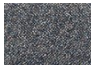
327 Twilight Format