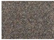
418 Burnished Iron