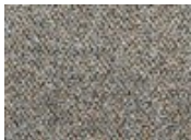
218 Hammered Tin