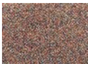
322 Sundried Tomato