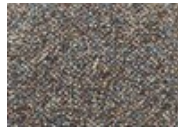
421 Metal Works