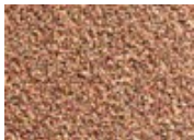
143 Exhilarating Pink