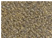
148 Golden Jazz