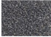
599 Pronounced Navy