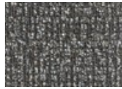
885 Latest Slate