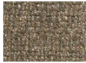
876 Distinct Olive