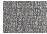
927 Revived Ash