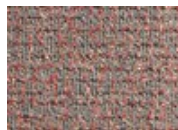
341 Brightened Red