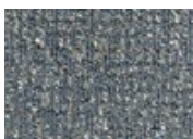
556 Invigorating Teal