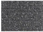
599 Pronounced Navy