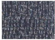
575 Renewed Blue