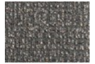
978 Keen Gray