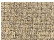
148 Golden Jazz