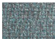
566 Saturated Turquoise