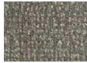
665 Refreshed Green