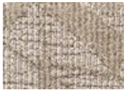
729 French Quarter