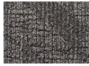
986 South Beach