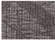
959 Ellis Island