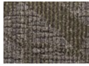
978 National Mall