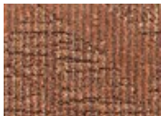
368 Napa Valley