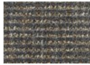
981 Checkered Flag