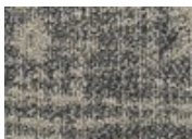
845 Moon River