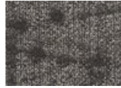
978 Timeless Renewal