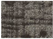
885 Nature's Palette