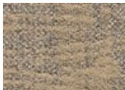
138 Sunny Forecast