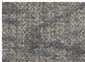
556 Ethereal Clouds