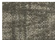
866 Tender Shoots