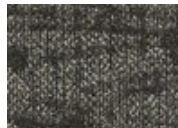
576 Deep Meditation