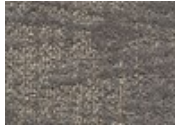
958 Happy Trails