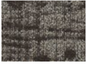
885 Nature's Palette