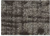
885 Nature's Palette