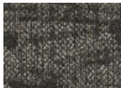
576 Deep Meditation