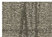
866 Tender Shoots