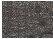
978 Timeless Renewal