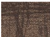
853 Authentic Undertones