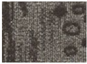
885 Nature's Palette