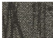
576 Deep Meditation