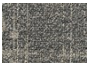
845 Moon River