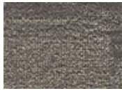
958 Happy Trails