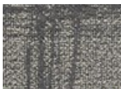
556 Ethereal Clouds