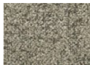
866 Tender Shoots