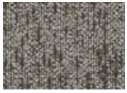
885 Nature's Palette