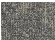
845 Moon River