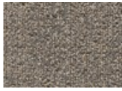
958 Happy Trails