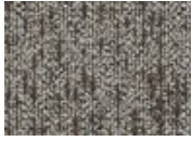
885 Nature's Palette