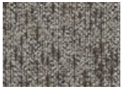
885 Nature's Palette