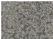
556 Ethereal Clouds