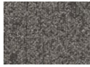
978 Timeless Renewal