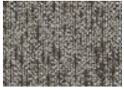
885 Nature's Palette