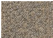
138 Sunny Forecast