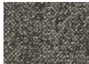
576 Deep Meditation