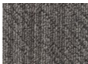
966 Low Rise