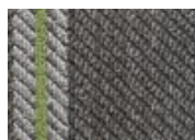
966 Low Rise