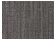
966 Low Rise