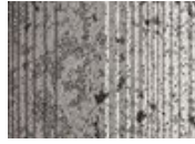
957 Top Notch