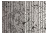
957 Top Notch