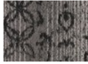
957 Top Notch