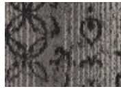
957 Top Notch