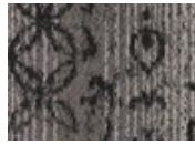
957 Top Notch