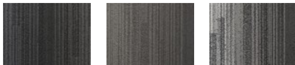
989 Masterly 969 Mature 957 Top Notch