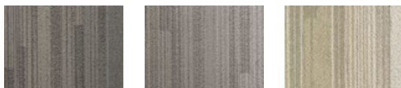
849 Flawless 837 Prime 728 Finest