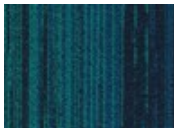
566 Peacock Quickship Available