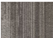
949 Everglade Quickship Available