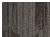
969 Cocoa Quickship Available