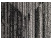
957 Metro Quickship Available