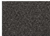
983 Iron Ore Quickship Available