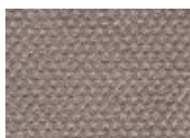
852 Havana Tan