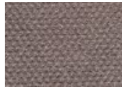
878 Wild Frontier