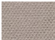
732 Bamboo Buff