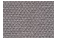
979 Ancient Marble