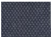
565 Night Navy