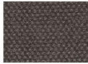
888 Cigar Leaf