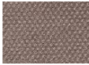
862 Ginger Snap