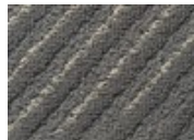
961 Medium Grey Gold