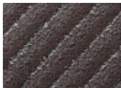
459 Lavender Silver