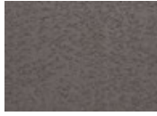
968 Medium Grey