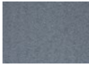
955 Medium Cool Grey