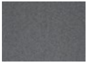
869 Medium Taupe