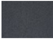
889 Dark Taupe