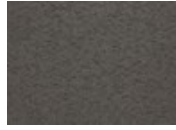
989 Dark Grey