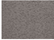
968 Medium Grey