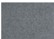
869 Medium Taupe