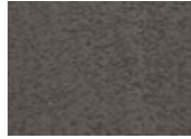
989 Dark Grey