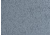
955 Medium Cool Grey