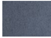
985 Dark Cool Grey