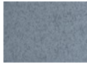
955 Medium Cool Grey