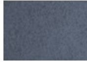
985 Dark Cool Grey