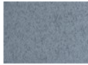
955 Medium Cool Grey