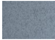
955 Medium Cool Grey