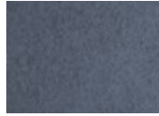
985 Dark Cool Grey