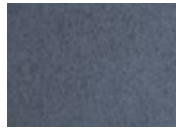
985 Dark Cool Grey