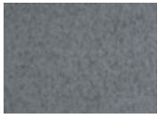
869 Medium Taupe