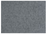
869 Medium Taupe