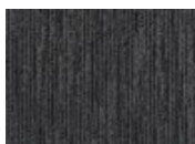
999 Oxidized Iron