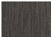
883 Corrugated Suede