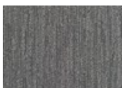
955 Perforated Tin