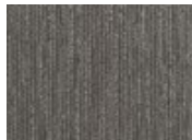
358 Galvanized Steel