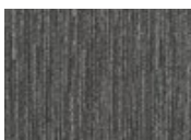
983 Polished Silver