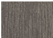
859 Salvaged Find