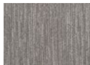
751 Metal Foil Quickship Available