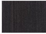
989 Out of the Black