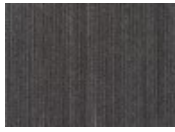
978 Wrapped in Grey