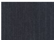
589 Blue on Blue