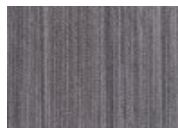
955 Livin' in the Grey