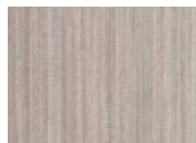
718 White Shadows