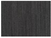
966 Velvet Green