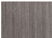
859 A Touch of Grey