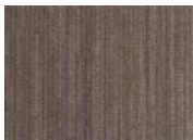
851 Fields of Gold