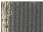
981 Yellow Pyrite