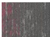
988 Pink Quartz