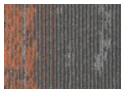
982 Orange Citrine