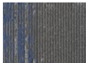
985 Blue Sapphire