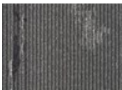
984 Purple Amethyst