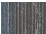
987 Ice Topaz