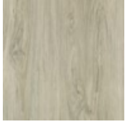
921 Shore Thing