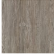
933 Silver Fox