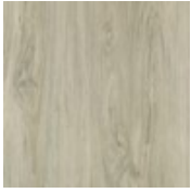
921 Shore Thing