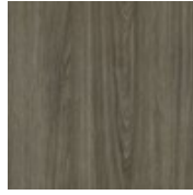
959 Grey Matters