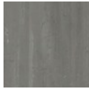
927 Sonic Silver