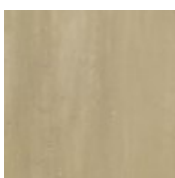
133 Totally Tan