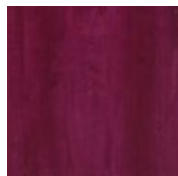
453 Vivid Violet