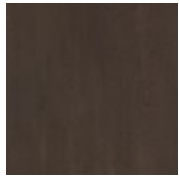
378 Chocolate Bar