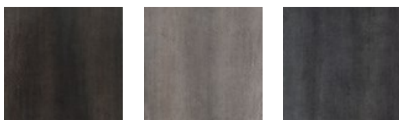
888 Coffee 928 Galena 985 Iguazu