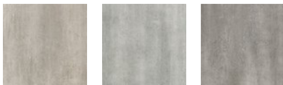
233 Playa 926 Frost 326 Illumen