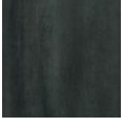
999 Hot Stone