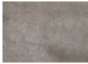
859 On The Line