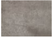
859 On The Line