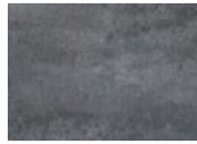
585 Blue Steel