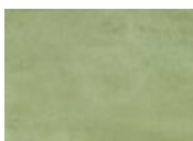
631 Lemon Lime