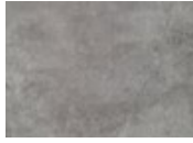
929 Proper Gray