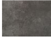
959 So Fetch