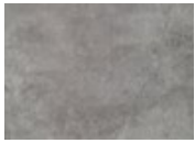
929 Paper Gray