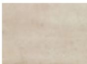
258 Viva Gold