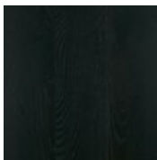
08 Shadow Oak