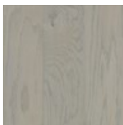
78 Sandstone Oak