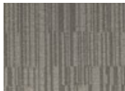
739 Glacier Quickship Available