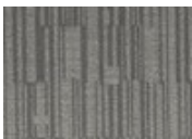
955 Coastal Quickship Available