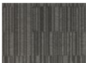
978 Mineral Quickship Available