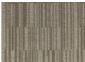
138 Sulpher Quickship Available