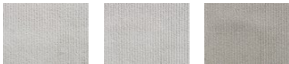
721 Bisque 733 Ecru 741 Wheat