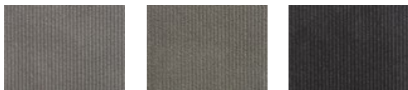
753 Aztec 836 Khaki 863 Noire