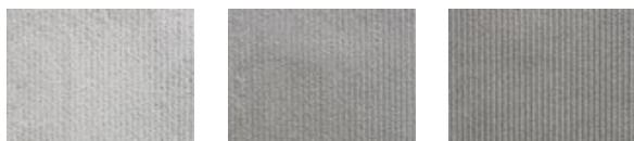
915 Haze 923 Seashell 948 Alloy