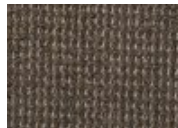
858 Mocha Brown