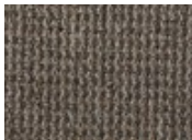
846 Pebble Stone