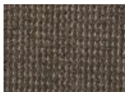
858 Mocha Brown