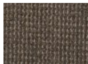
858 Mocha Brown