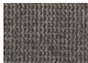
968 Natural Neutral