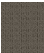
938 Navarino Smoke