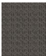
934 London Dust