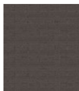
934 London Dust