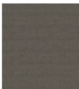
938 Navarino Smoke