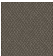
938 Navarino Smoke