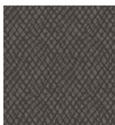
934 London Dust