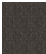
934 London Dust