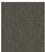
938 Navarino Smoke