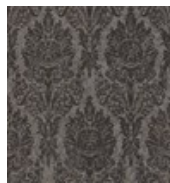
934 London Dust