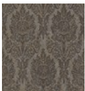
938 Navarino Smoke