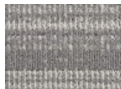
739 Glacier Quickship Available