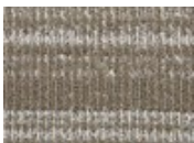
138 Sulpher Quickship Available