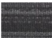
978 Mineral Quickship Available