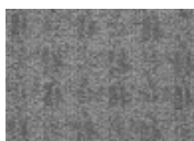
945 Thread Quickship Available