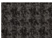
889 Facing Quickship Available