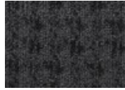
989 Pique Quickship Available