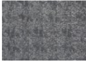
965 Needle Quickship Available