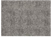
948 Binding Quickship Available