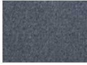
964 Smokestack Quickship Available