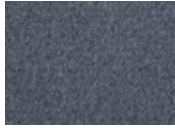
964 Smokestack Quickship Available