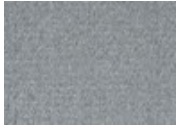
948 Quartz Quickship Available