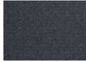
978 Mineralite Quickship Available