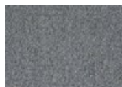
928 Majolica Tin