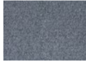
965 Steel Quickship Available