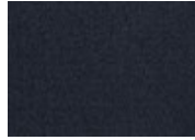
989 Onyx Quickship Available