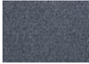
964 Smokestack Quickship Available