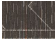
878 Mudslide Quickship Available