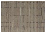
131 Madras Quickship Available