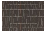
878 Mudslide Quickship Available