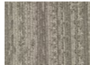
751 Perfect Paths