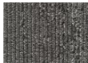
983 Clean Slate