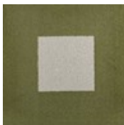
667 Green Light Grey