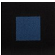
589 Black Navy