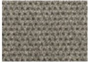
7959 Defining Moment Quickship In Stock