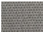
7714 Self Expressions Quickship In Stock