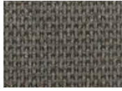
7978 Checking In Quickship In Stock