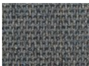
7559 Forward Bound Quickship Available