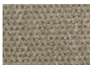
7958 Style Shaper Quickship Available