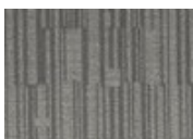
955 Coastal Quickship Available