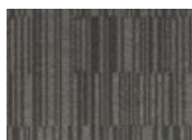
978 Mineral Quickship Available